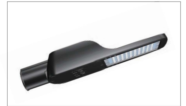
型号: LDTYN-LDZ09402 型