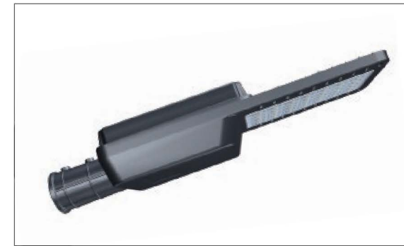
型号: LDTYN-LDZ09403 型