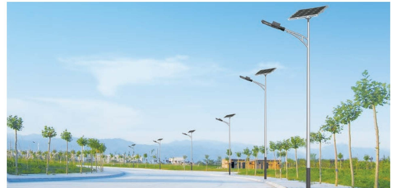
型号: LDTYN-09401 型 高度: 5-8m 光源: LED

地址: 扬州市北郊高邮菱塘镇工业园区 ( 邮天路与新扬菱路交界处 ) 传真: 0514-84238418 http://www.bswjt.com( 照明网址 )