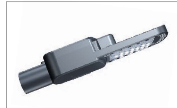
型号: LDTYN-LDZ09401 型

Color Temperature, Wattage and optical angle can be customized. All parameters are tested at 25 °C ambient temperature, 65% humidity laboratory environment. All Luminous flux is the maximum value among all kinds of light distribution.